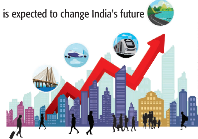
ILLUSTRATION: SACHIN VARADKAR

In infrastructure sector, India is planning to complete work worth Rs 25 lakh crore in five years. Further, 80,000 kms of rural roads have been laid and the target of 40 kms of road construction per day is being planned to boost road infrastructure. Electricity output rose to a 16-month high of 10.3% in August. On the revenues front, the direct tax revenue collections as on date in FY 2017-18 rose to Rs. 3.7 lakh crore with a